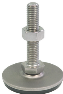
Levelling foot GN 440.5 with vulcanised rubber